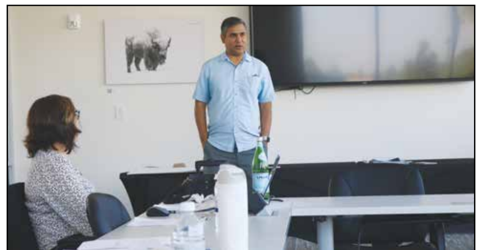
Chamber board

Consisting of volunteer opportunities and a redeveloped suite of programs, the center provides an innovative and valuable educational experience that enables women in business to make sound decisions and develop the infrastructure to facilitate business growth and prosperity. For more information, call 904-366-6633 or go to jaxchamberfoundation.org/jacksonville-womens-business-center .