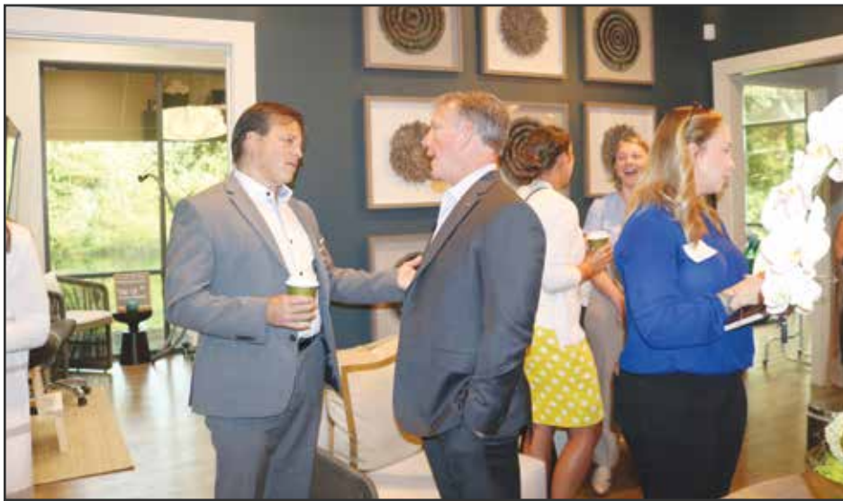
Guests mingle during the Before Hours showcase at Amara Med Spa.