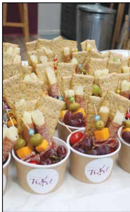
An array of edible arrangements was available at the Painting With a Twist event.