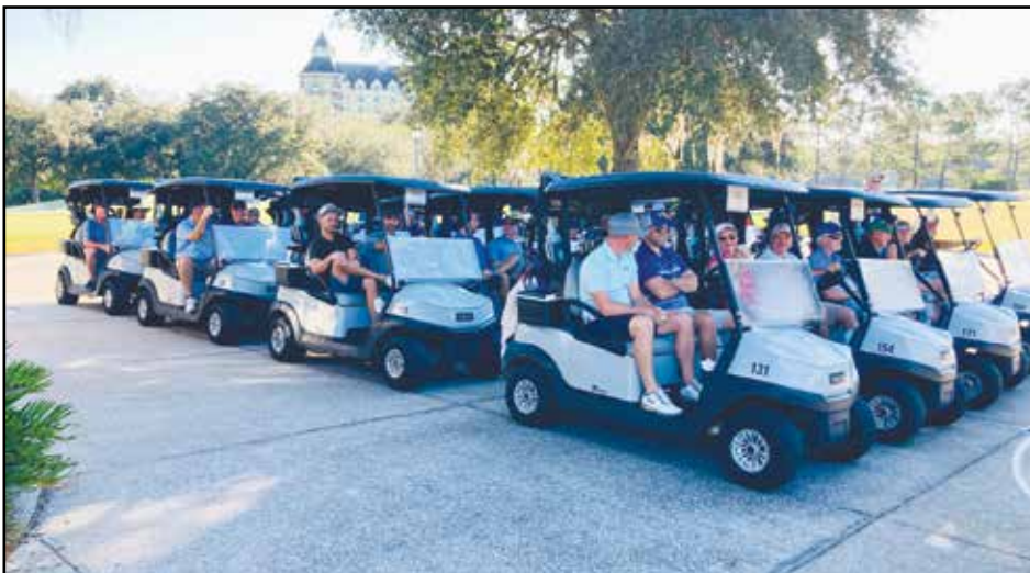
The golfers begin the day.