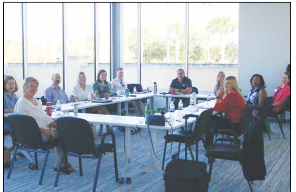
The board of directors met and discussed strategy at the link.

aligning council/division and ambassadors to reflect market segments and county growth, as well as streamlining communication channels and expanding outreach to Jacksonville and young professionals.