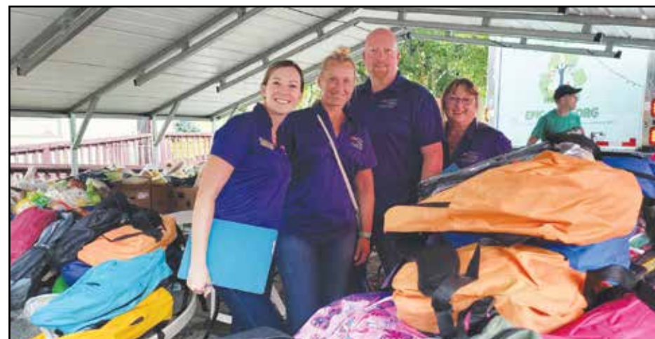
Leadership St. Johns 2021 Class members help SEA Community Help Resource Center provide backpacks and school supplies.

and families in need of many required items to begin school.