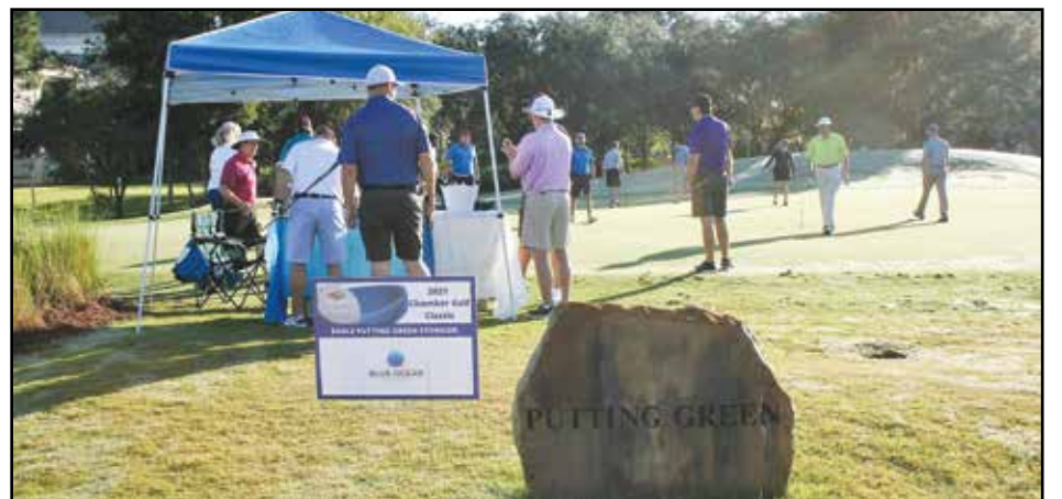
The putting green, sponsored by Blue Ocean Title, was enjoyed and began the golf tournament.