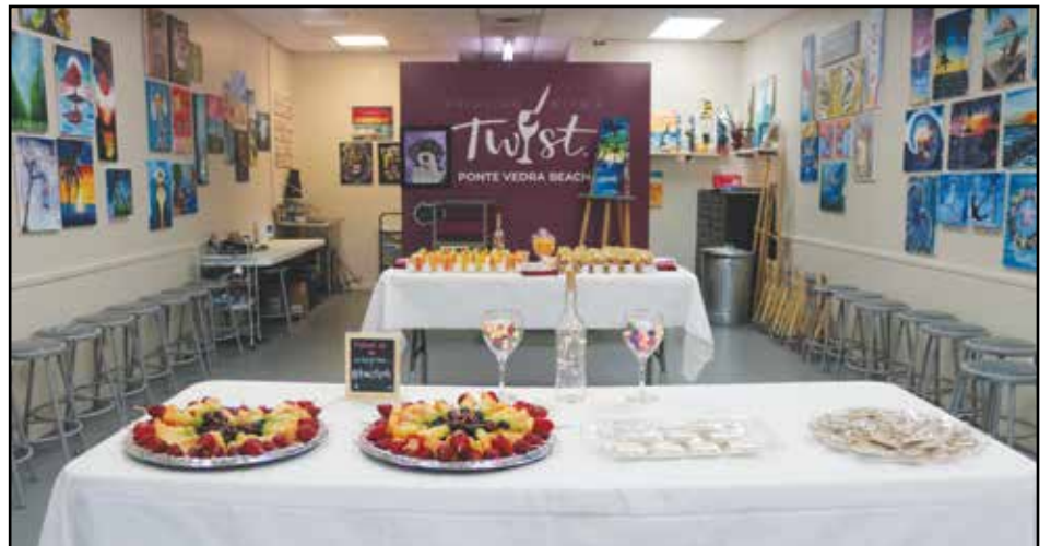
Painting With a Twist had a variety of food samplings on display.